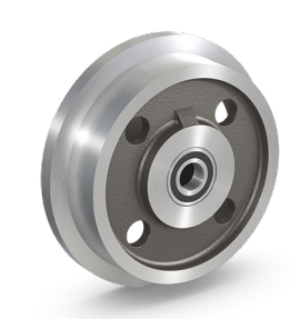
Single-flanged wheel made of grey iron