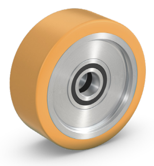
VULKOLLAN<sup>®</sup> load wheel